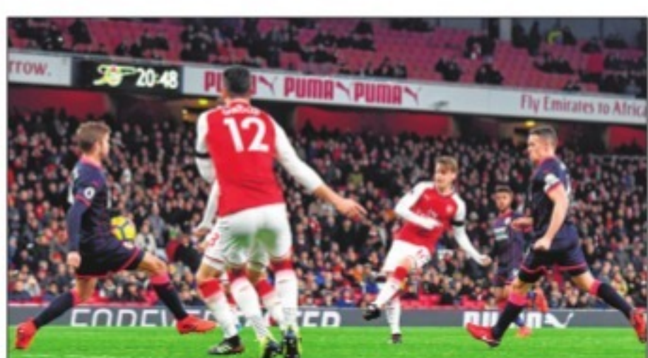
Arsenal's Mesut Ozil (C) sees his shot blocked by Huddersfield goalkeeper at the Emirates Stadium in London.

The German international set up substitute Giroud in the 68th minute and contributed to Alexis Sanchez's goal a minute later before making it 4-0 in the 72nd