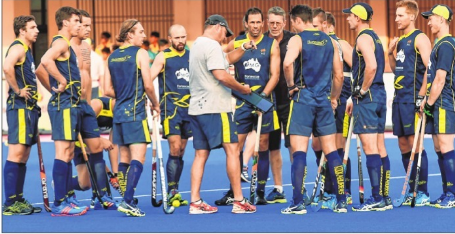
The Australian team during a training session at the Bhubaneswar Stadium on Thursday.

"It's about the mindset and belief. You have to believe that